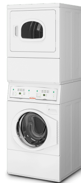
Stack Washer & Dryer