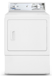
Single Load Electric & Gas Dryer