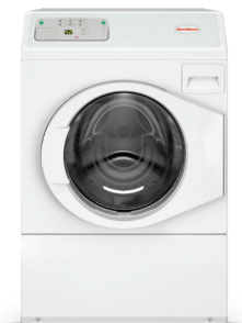
Commercial Compact Washer